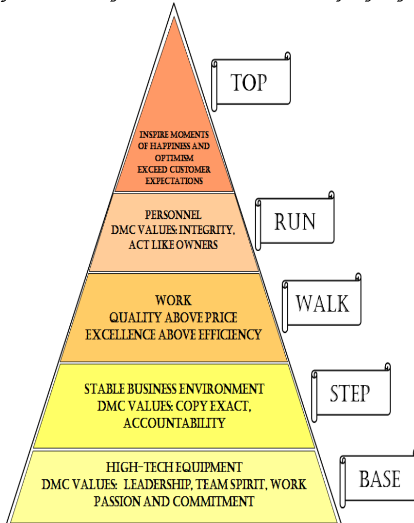
Figure no. 2

Our vision serves as the framework for our Roadmap and guides every aspect of our business by describing what is the company's path towards sustainable, quality growth. Driessen Manders Company vision outlines the company's aspirations and details the values and actions implemented to pursue our Roadmap. The vision has been developed to represent a pyramid (figure no. 2) with five levels that symbolizes Driessen Manders Company way to the top!